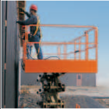
MegaDeck™ Optional Deck Extension Improves Operator Reach for Greater Productivity