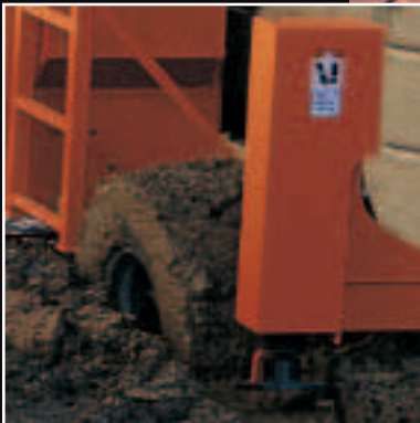
Unmatched Rough Terrain Performance