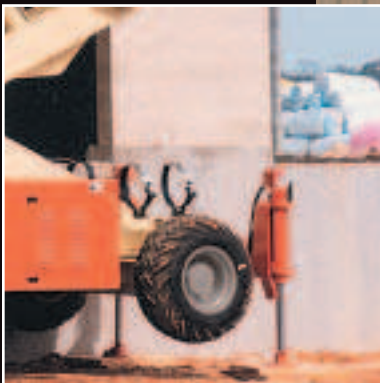
Independently Controlled Leveling Jacks for Enhanced Performance